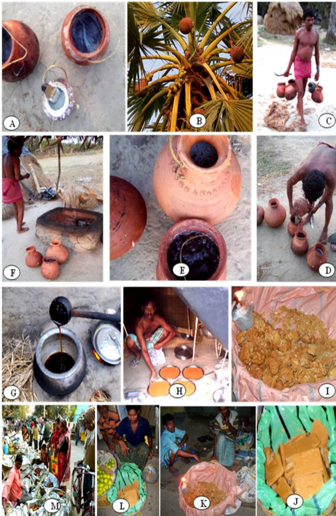
Plate 1 : A. Pitcher (Vaar) coated with lime, B. Female inflorescence is covered with pitcher, C. An ethnic people carrying the sweet sap, D. Mixing all the sweet sap, E. The pitcher with full of sweet sap, F. Preparing for boiling, G. Concentrated sweet sap, H. Spreading sweet sap, I & J. Two types of patali, K, L & M. Sailing patali in local markets.